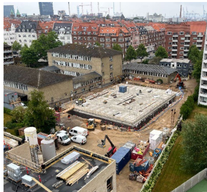
Construction site May2023 vs Sep2023 →→ Progress!